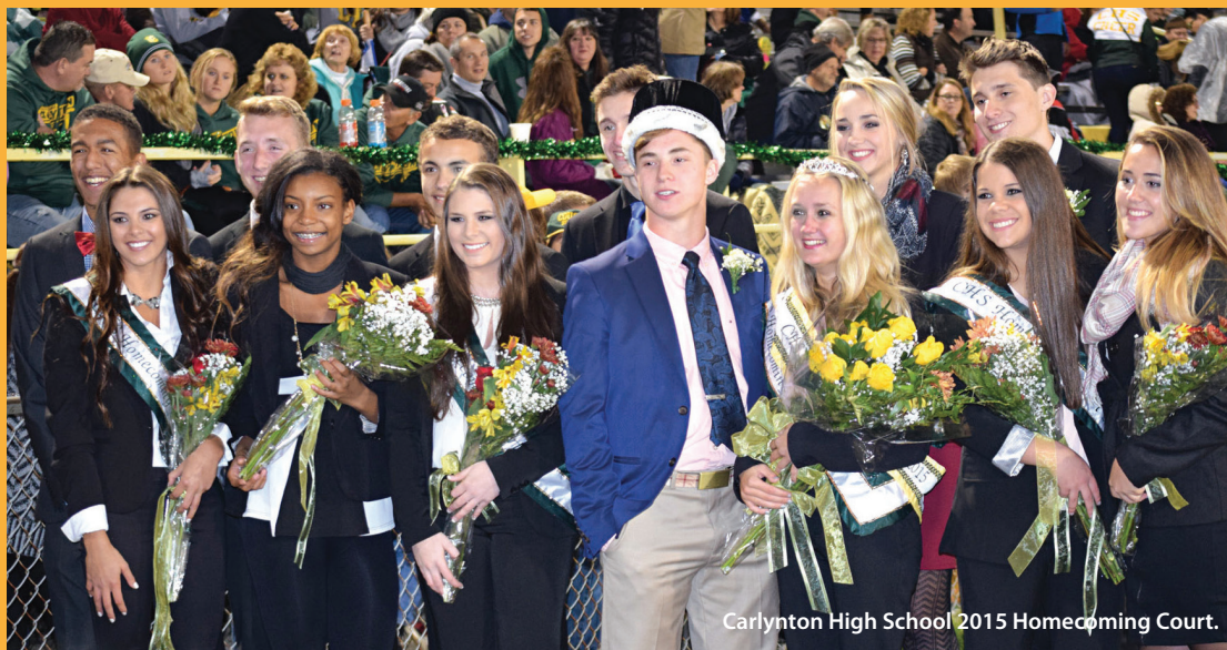
Carlynton High School 2015 Homecoming Court.